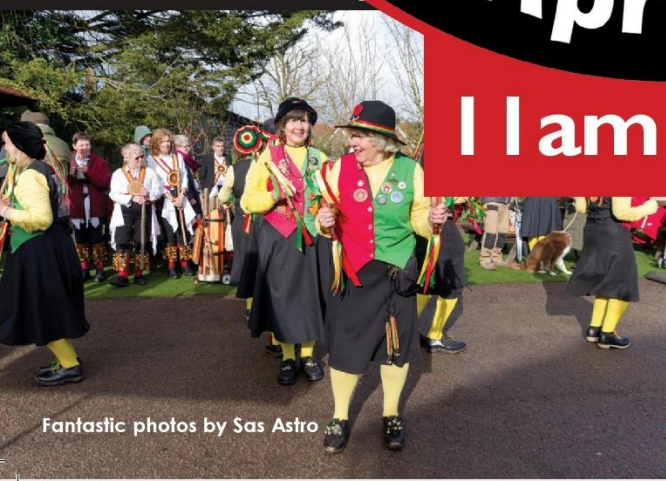
Fantastic photos by Sas Astro